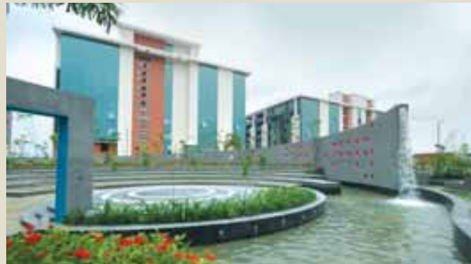
Ecospace, the Ambuja Neotia Corporate Office

With its forte in Realty, Hospitality, Healthcare and Education, Ambuja Neotia has created landmark projects in and around Kolkata. The Group has always been conscious towards creating better and greener spaces, resulting in consumer delight. Ambuja Neotia has partnered with eminent architects and consultants to create aesthetically appealing and refreshing environments while being sensitive to the location.