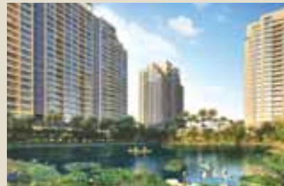
Your Lake. Your World.