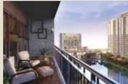
Your Apartment. Your World.

Rediscover Your Space. Rediscover Your Benefits.