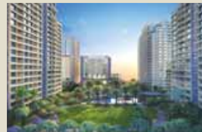
Your Greens. Your World.