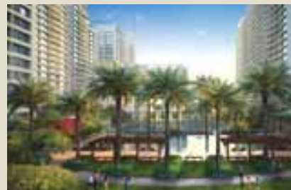
Your Podium. Your World.