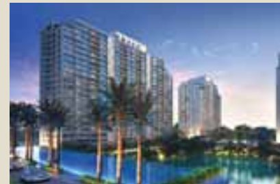
Your Club. Your World.